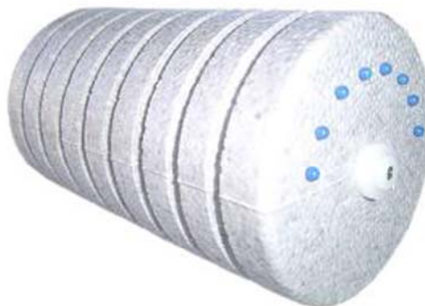
Above Leader Rig Dispenser Refill