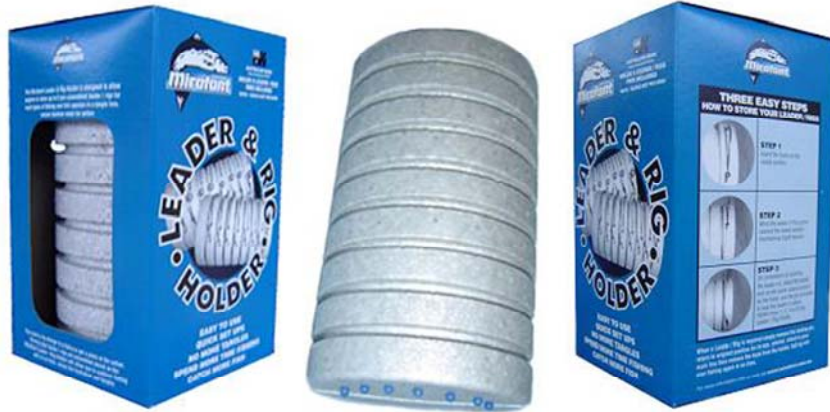
Above Leader Rig Holder